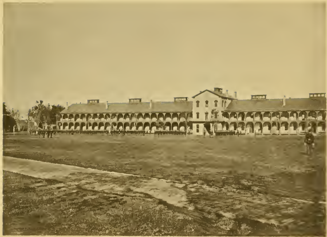
DRESS PARADE — SOLDIERS' BARRACKS IN REAR.